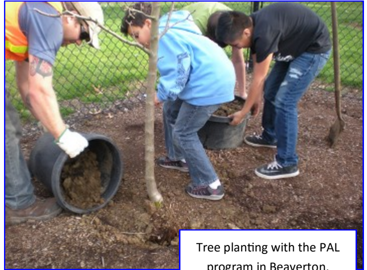
Tree planting with the PAL program in Beaverton.

At our December meeting we made 80 flower arrangements in Christmas mugs for the residents of one of our Retirement Centers. All mugs were filled with oasis and greens which were brought from members homes. We also had roses, chrysanthemums and baby's breath available.