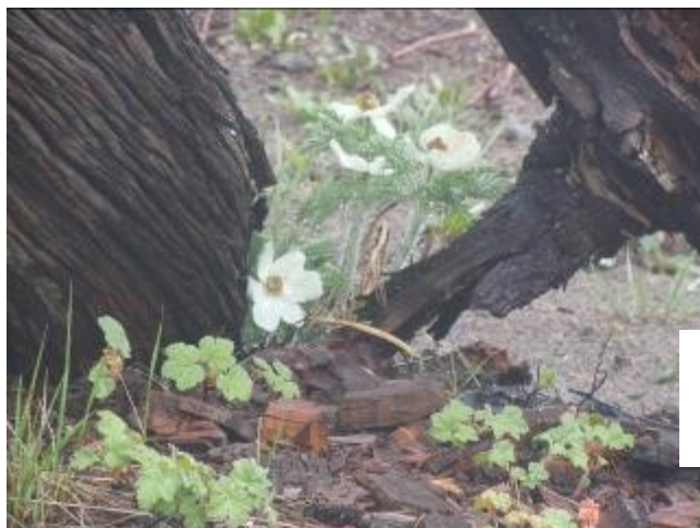
Western Pasqueflower at Crater lake National Park

Have you been to any or all of these parks? Send the Mahonia your pictures! We will publish some of them in the upcoming issues depending on room.