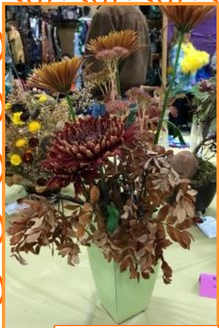
Autumn Joy Design