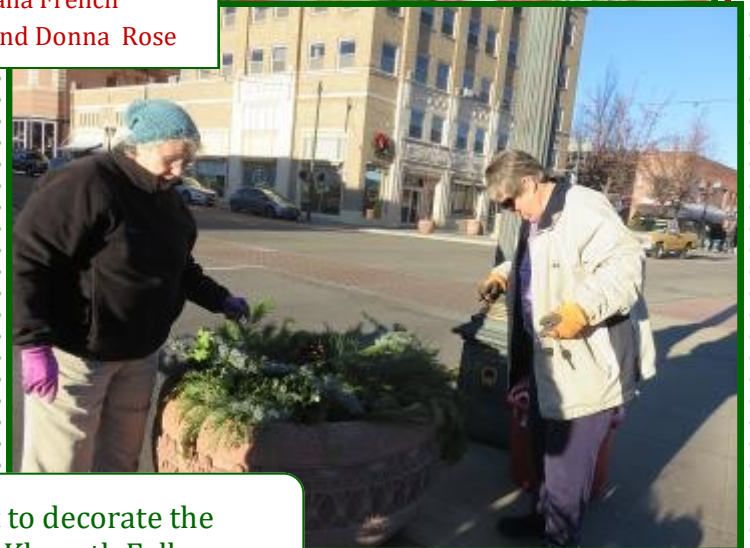
The other leftovers went to decorate the Down-town planters in Klamath Falls.