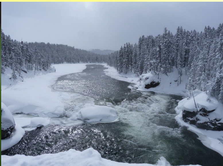
2019 LANDSCAPES/SEASCAPES-BLACK/WHITE. "Yellowstone" by Cindy Winfield.