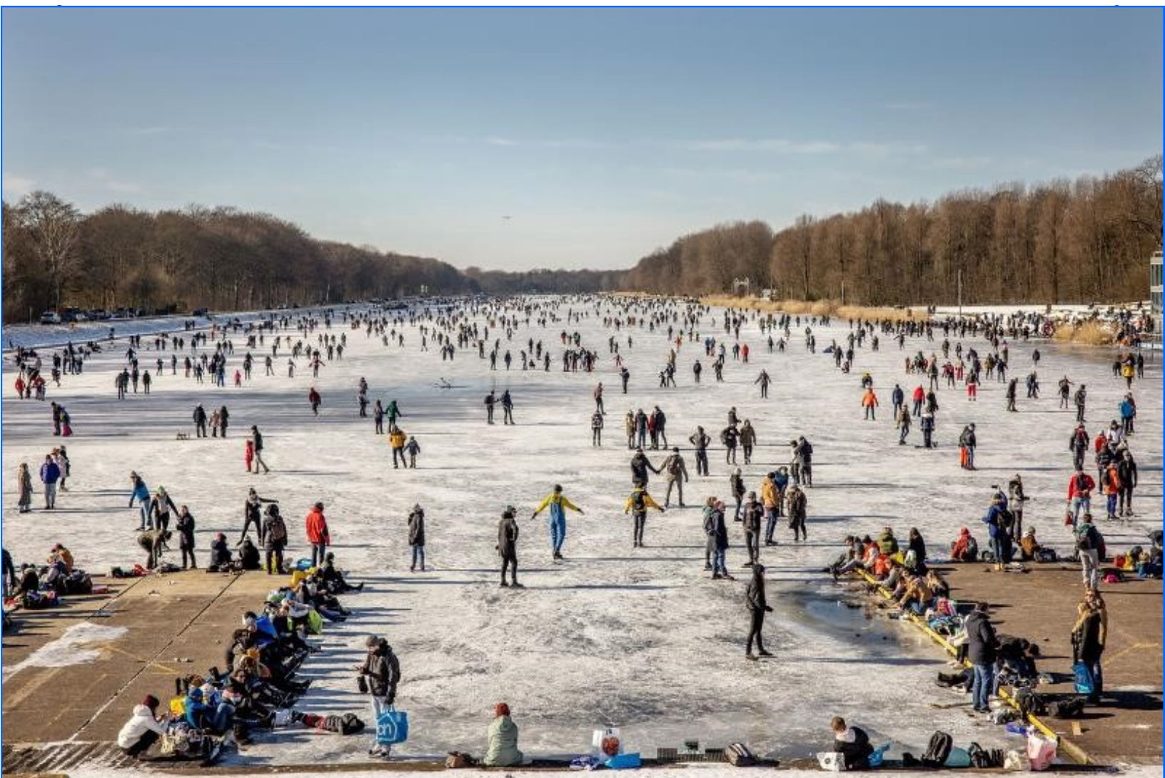
2-14-2021 Lots of skaters In Amsterdam Holland