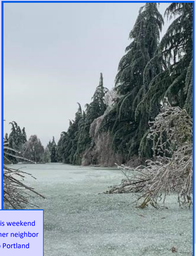
Pictures from this weekend are from my former neighbor who moved to Portland