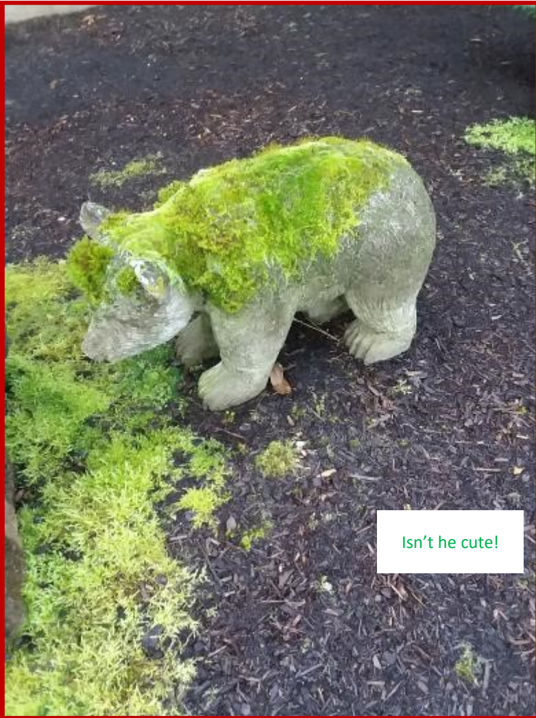
Isn't he cute!

on a statue, turkey tail mushrooms (In Dutch you call them little elf seats-elfenbankje)