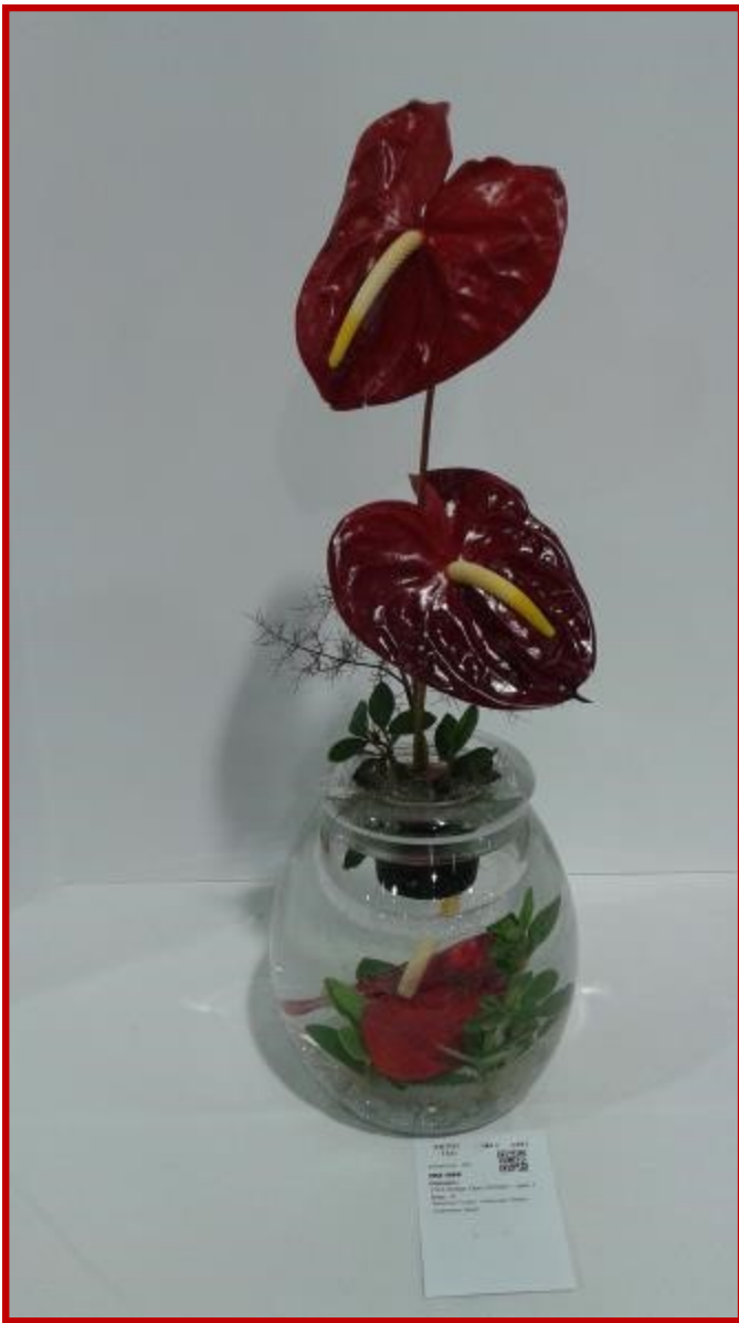
An Underwater Design

More fun from our amazing designers! Doesn't that make you feel like you would like to try your hand at designing? Looking forward to see your Valentine's Day designs!