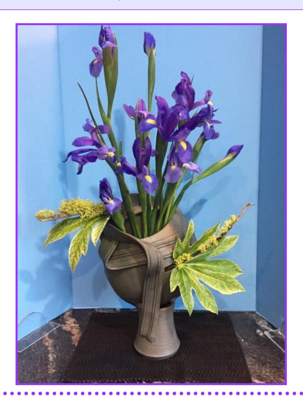
Designer: Nita Wood, Grow and Show Garden Club, Salem, OR NGC Judge

Too much dominance. Big container, big green, big purple. All the components were large. Very nice container. Nice colors on the plant material.