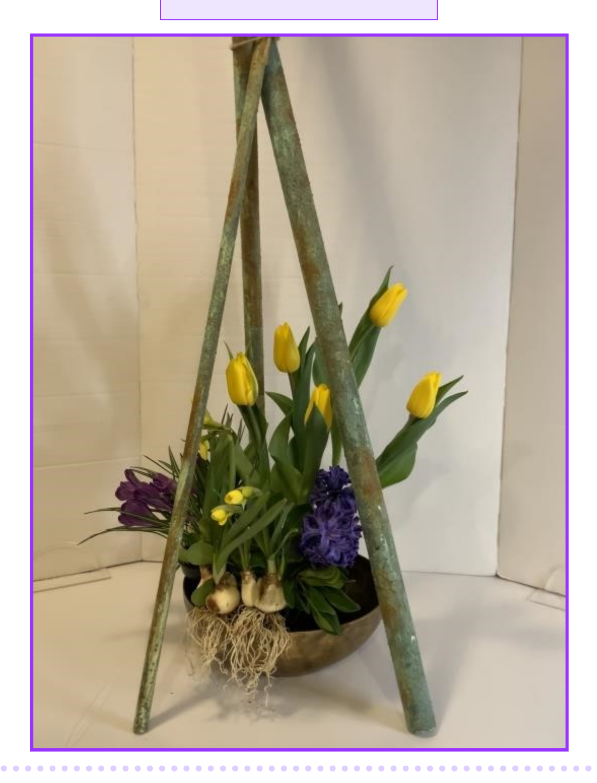
Linda Shamp Portland Judges council. Yellow tulips, purple hyacinths , petite purple iris, petite yellow daffodils.

Creative idea. The Featured Plant Material was disrupted by two different colors of purple.