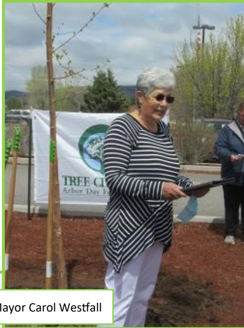
Mayor Carol Westfall