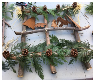
Evening Primrose Garden Club made these cute wreaths and placed them in city areas.