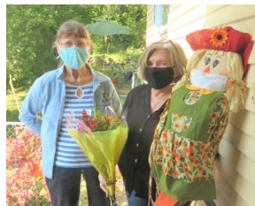
Delivering "Pass the Bouquet"