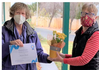
Northside Garden Club giving a Sunshine Award