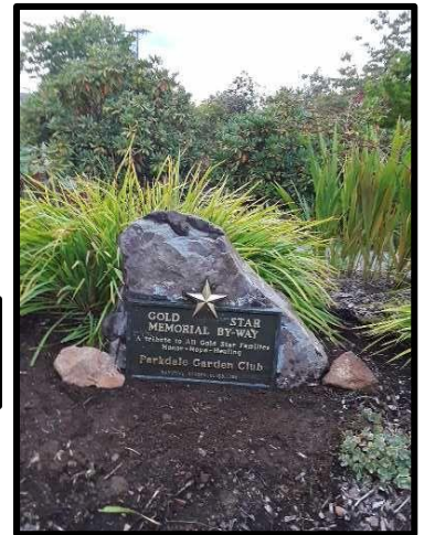
Gold Star Memorial.