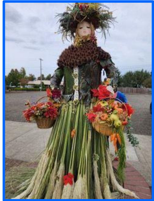
Goldie the Golden Damsel 2nd Place

Join us. We are growing. Canbygardenclub.com