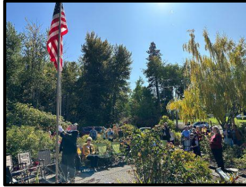
Gold Star dedication.

Following the lunch and meeting was the dedication of a Gold Star Marker at the Parkdale Bicentennial Memorial Garden. It was a lovely fall afternoon for this event!