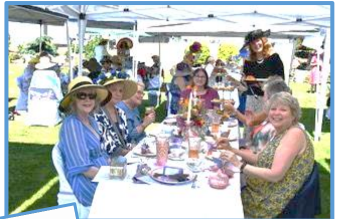
75 Years Canby Garden Club