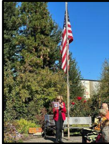
Gold Star dedication.