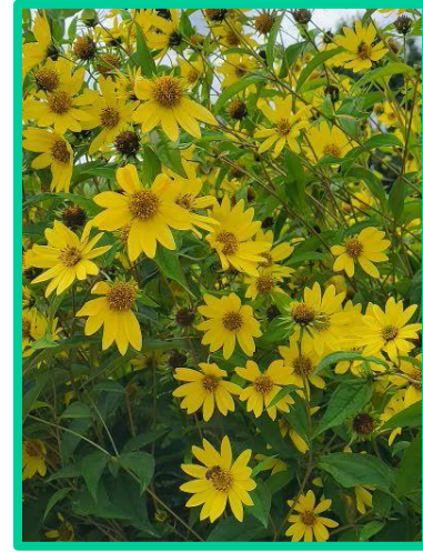
Plants in the Garden