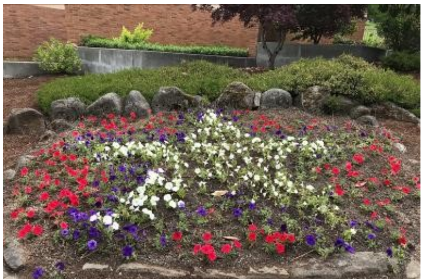
Star at the entrance of Willamette National Cemetery