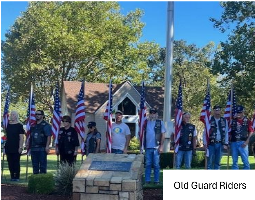
Old Guard Riders

Ida Pruitt Blue/Gold Star Chair for Central Point Garden Club