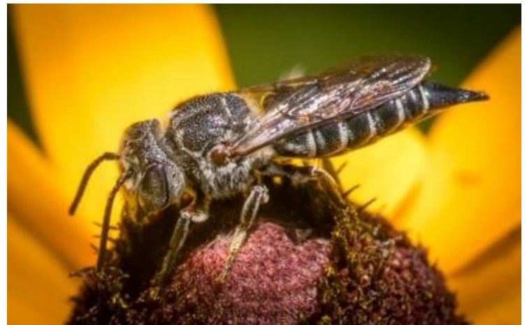
Cuckoo bee ( Coelioxys sp.)