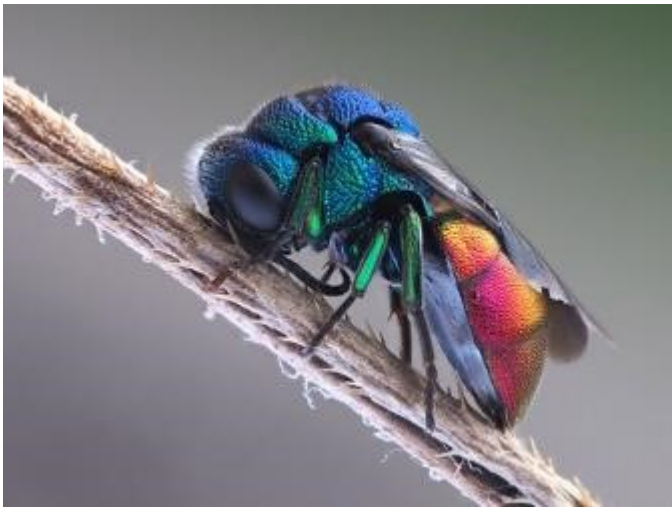
Cuckoo wasp ( Holopyga generosa)