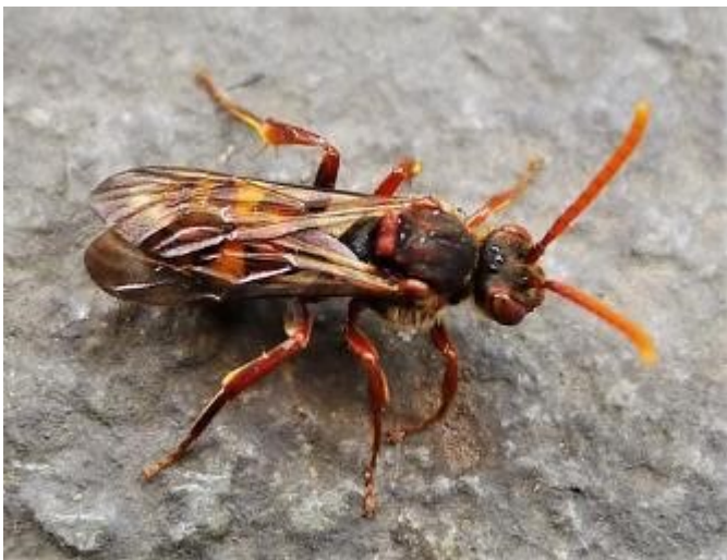
Cuckoo bee ( Nomada ruficornis ), gailhampshire