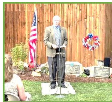
G.V. Ayers Odell Church of Christ