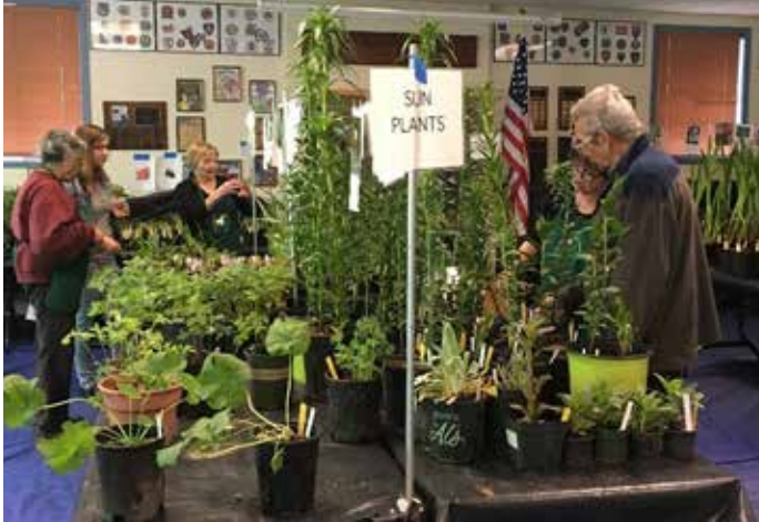
Responding to questions at our plant sale..

What a fun fundraiser - the Columbian Garden Club Annual Spring Plant Sale! This year's plant sale is April 25th 10:00-2:00 at the Corbett Community Church on Mershon Road and Highway 30. Due to construction at the Corbett Fire Station, the plant sale is relocating. There will be treasures from our members' gardens plus other donations. For sale at bargain prices will be perennials, shrubs, native plants, trees, annuals, vegetables and specialty items! Carryout service will be available. Proceeds from our sale benefit club civic landscape projects, educational programs, and a horticulture scholarship. All activities promote the beautification and conservation of our environment.